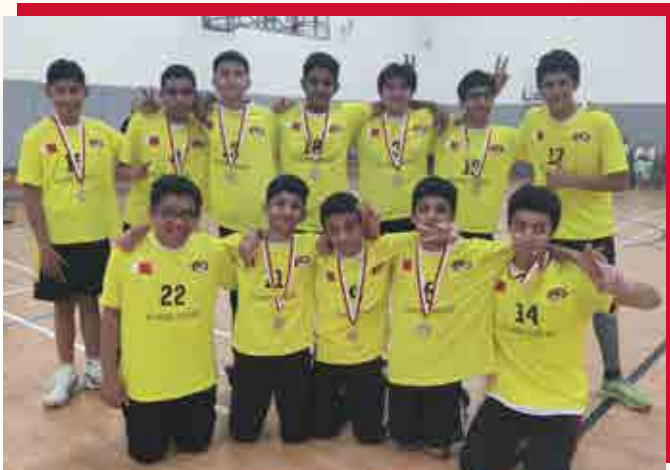
U14 volleyball - Boys