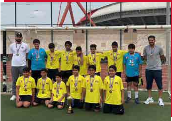
U12 Football - Boys