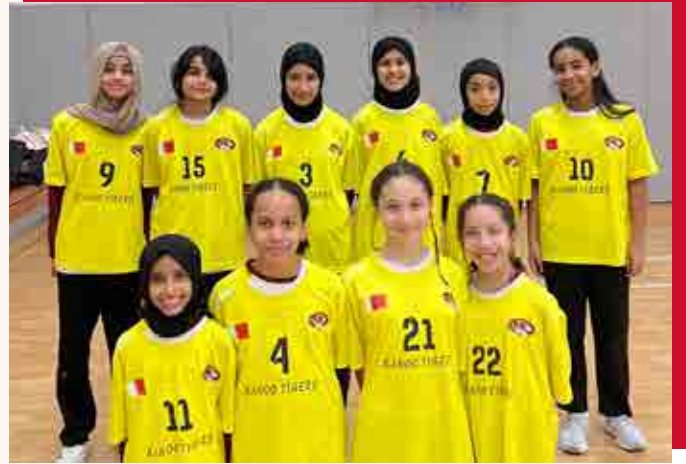
U14 Volleyball - Girls