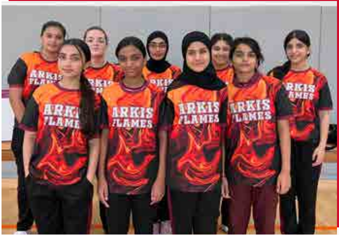
U14 Basketball - Girls