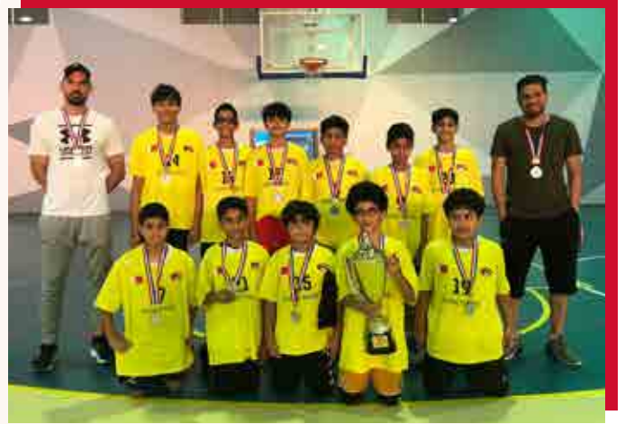
U12 Basketball - Boys