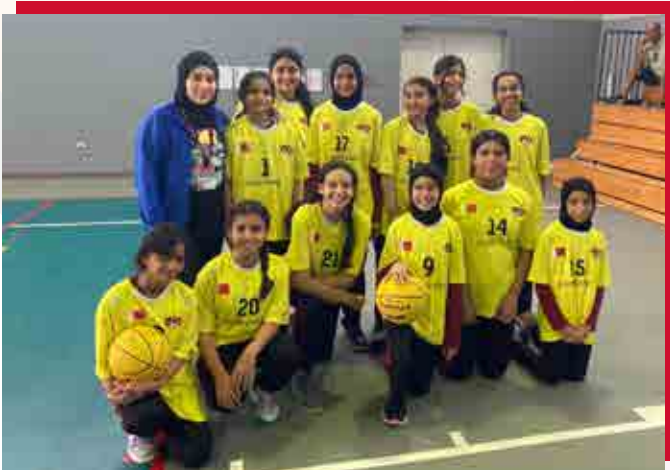
U12 Basketball - Girls