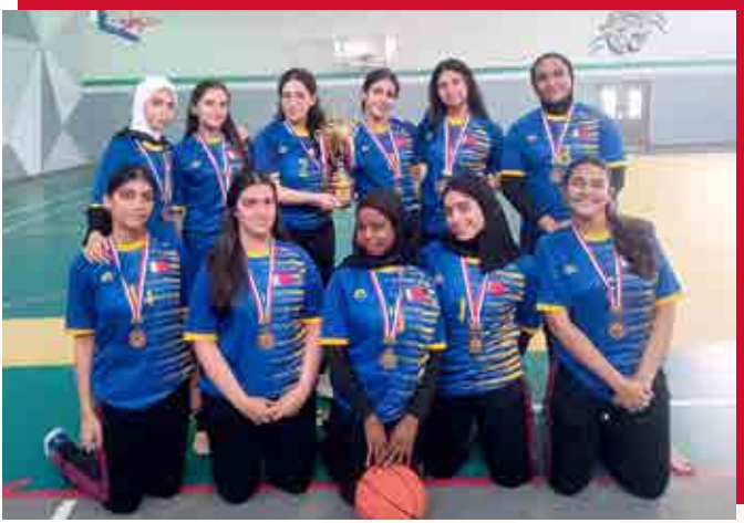
U18 Basketball - Girls